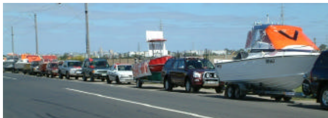
Ready to roll at the Westgate Rally!