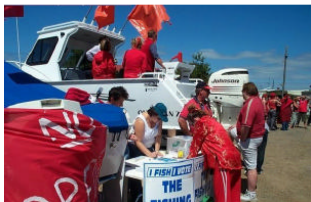
TFPVic signing up new members at the rally

The free fish BBQ at the end of the rally was put on by the Port Phillip and Westernport Commercial Fishermen's Association and was also a glowing success. A big THANK-YOU goes out to those that helped make the event the success it was!